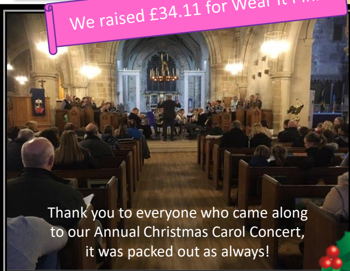
Thank you to everyone who came along to our Annual Christmas Carol Concert, it was packed out as always!