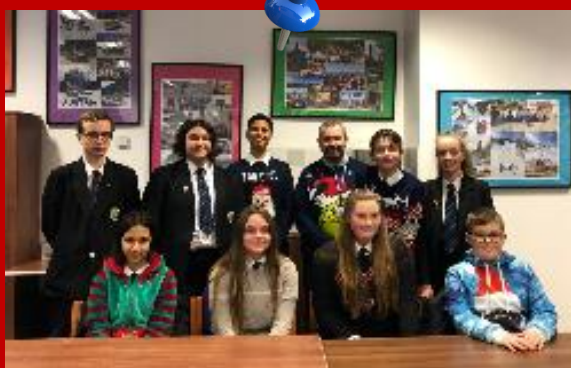
Our Student Council were feeling festive on Christmas Jumper Day for their monthly meeting...

Thank you to Chartwells for the numerous occasions where they have provided outstanding food for events within school, including the OAP Christmas Party, the school Christmas dinner and for the student reward lunches.