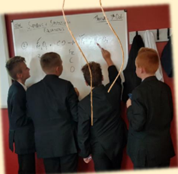
Earlier this term some of our Year 8 students worked together on balancing equations. Which is something that students can struggle with even at Key Stage 4. Well done boys! Scientists in the making?